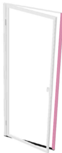
HV01x93- N -R